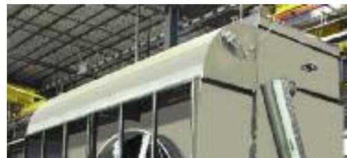
Optional Warm Air Recirculation System