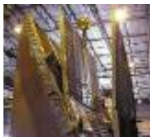
Main Lower Installation