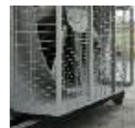
Optional Bug Screen / Lint Screen