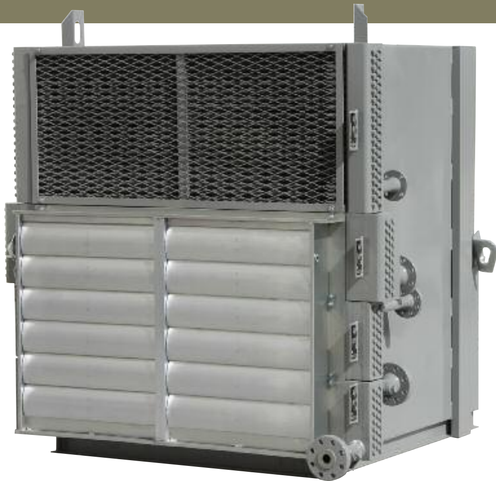
54 VI with Standard Core Guard and Optional Automated Main Louvers

MODEL VI Vertical discharge, induced-draft, engine or electric motor-driven cooler.