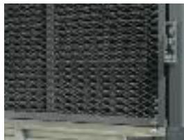
Cooling Section Core Guard (Standard)