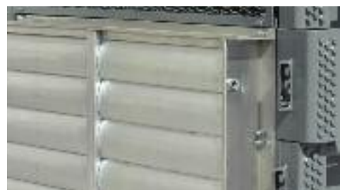
Optional Automated Main Louver