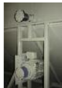
Optional Electric Drive