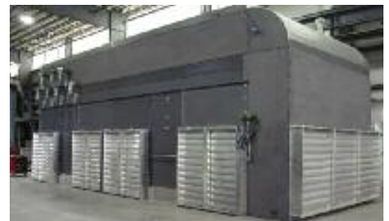
Optional Over-the-End Warm Air Recirculation System