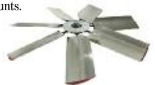
Optional Low Noise Emission Fan