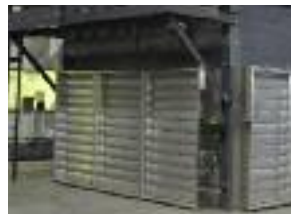
Optional Automated Louvers