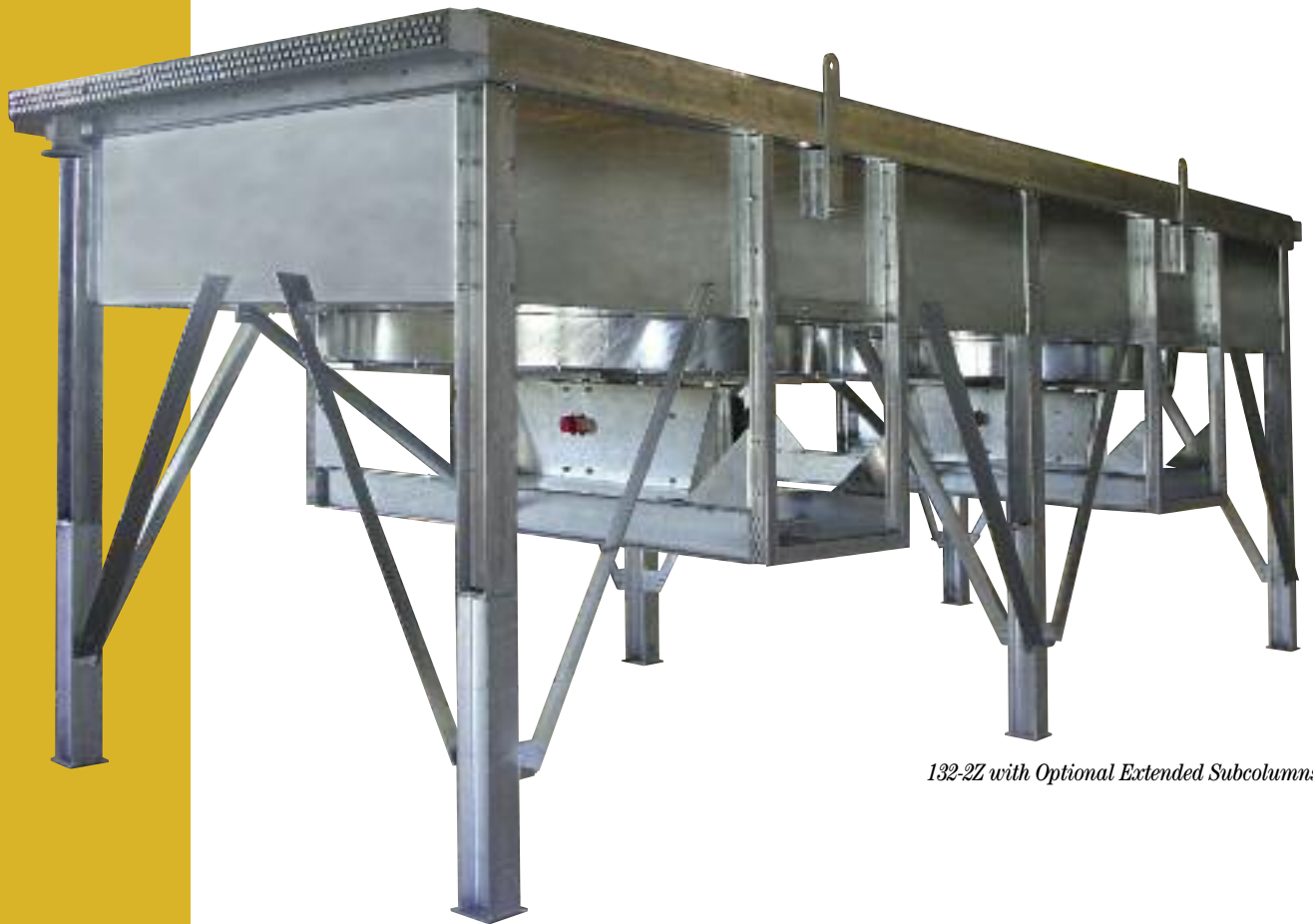
132-2Z with Optional Extended Subcolumns

MODEL Z A bolt-together horizontal cooler designed for high-horsepower applications.