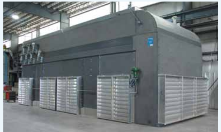
Optional over-the-end warm air recirculation system

180-3Z with advanced Stice Drives (Optional subcolumns not shown)