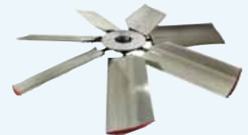
Optional low noise emission fan