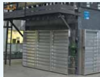
Optional automated louvers